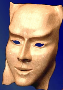
Silver Ash 12.8cm x 9.2cm x 4.6cm