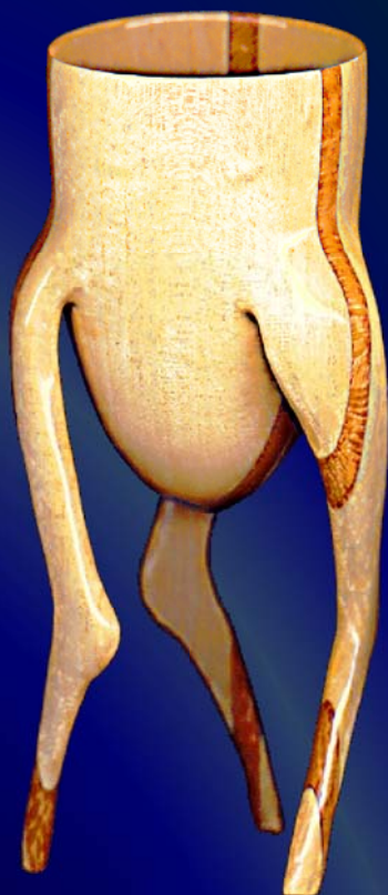
Silver Ash with Silky Oak insets

Poised between worlds, they provide glimpses into the realms of the imagination.