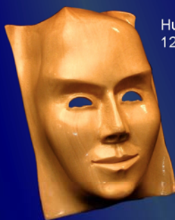
Huon Pine 12.7cm x 8.7cm x 5.8cm