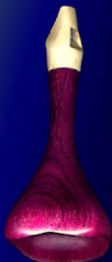
Purpleheart and Holly