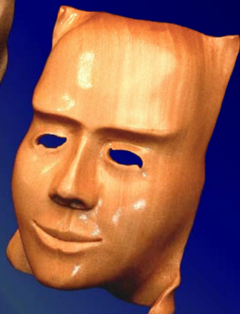
Huon Pine 12.8cm x 8.7cm x 5.2cm