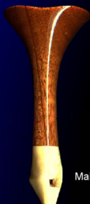
Mahogany and Holly